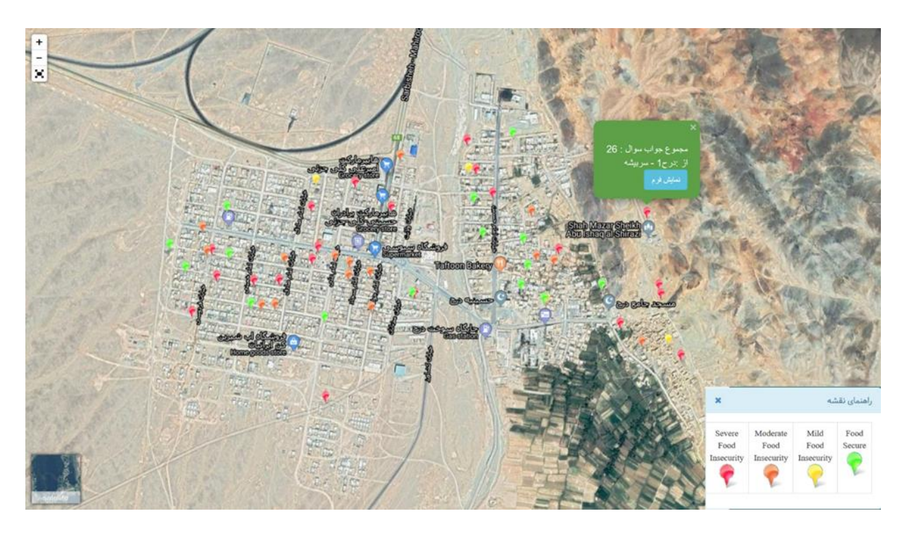
Figure 3. Distribution map of household food insecurity up to neighborhood and household level in SAMAT system