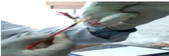
Figure 1. Demonstration of subcutaneous injection of trimethyl tin in rats

Alzheimer's disease was induced in 44 rats by intraperitoneal injection of a single dose of 10 mg/kg trimethyltin chloride (TMT; Sigma-Aldrich, USA) (14) (Figure 1). Fourteen days later, memory and learning tests were performed on them, and several mice were compared with the control group by the shuttle box and Y maze test (15). For familiarization of the animals with the training protocol, the rats performed weight-bearing exercises for 5 days and each training session for 5 minutes using a ladder with a height of 1 m. After this period, the training protocol was carried out for 6 weeks (Figure 2). The main exercises were done for 8 weeks, 3 sessions a week. The mice had resistance training in the first to fourth week with 30%, and in the fifth to eighth week with 10% of the body weight. The Morris water maze test was used for memory and spatial learning 4 weeks after exercise induction. The movements and behavior of the animals were tracked and recorded by Auto Vision 7 software (Calgary, Canada) and a camera installed on top of the tank. In this way, the swimming path of the mouse was recorded in each training, the time it took the animal to find the Plexiglas platform (hidden platform) and the time it spent in the quarter of the target circle was measured, and the adjustment steps were measured as well.