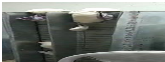
Figure 2. Demonstration of weight-bearing exercises by rats